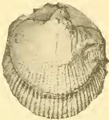
FIG. 1.—RENSSELAERIA MAINENSIS, MOLD OF INTERIOR OF PEDICLE VALVE. NAT. SIZE.

The accompanying figures represent the molds of the interior of a pedicle and brachial valve of full size, as they appear in the rocks of Chapman Township, Aroostook County, Maine.